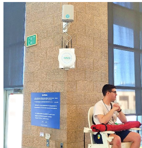
A guard at the Clearfield Aquatics Center watches over swimmers with WAVE.

We also deployed a new system for the City of Vancouver WA's Parks, Recreation & Cultural Service. This large system has received significant regional attention and is opening up several follow-on opportunities for the expanding WAVE into the Pacific Northwest.